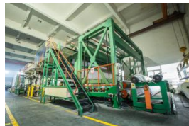
Coating machine 涂层机