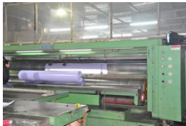
Surface treatment machine 表处机

Calendering machine 压延机 5M Laminating machine 5 米热贴机 Knife coating machine 刀刮机